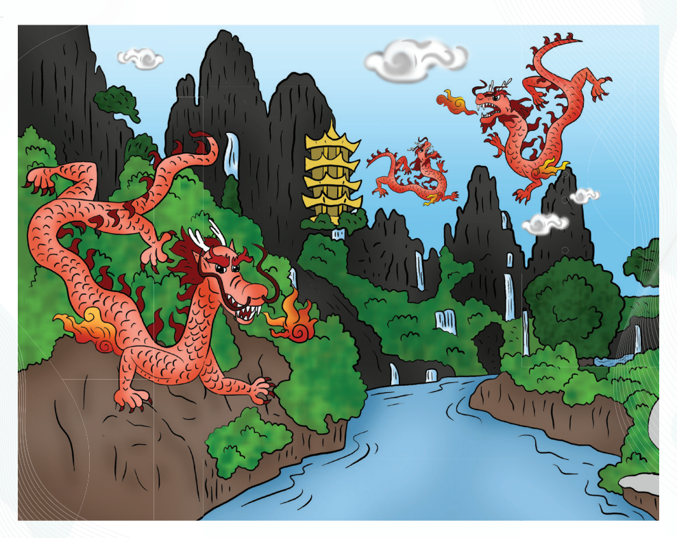
Marble Mountain and the Flying Dragons.

Willy, the Fighting Fish, comes from the Betta Fish lineage, known for its fighting capabilities. Willy's natural habit extends to Southeast Asia. Willy, the Fighting Fish,'s scientific name is: Betta Splendens .