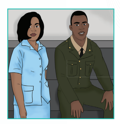
Mother standing with Soldier