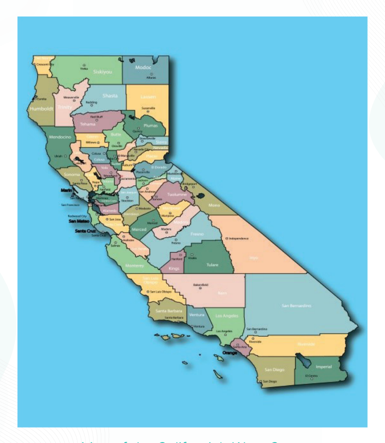
Map of the California's West Coast