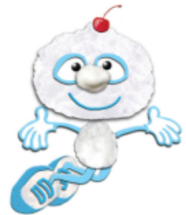
Puff the Cloud