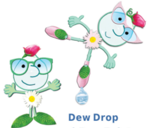
Dew Drop and Dew Pointe

"My water friends and I may look different but we're all the same inside!"