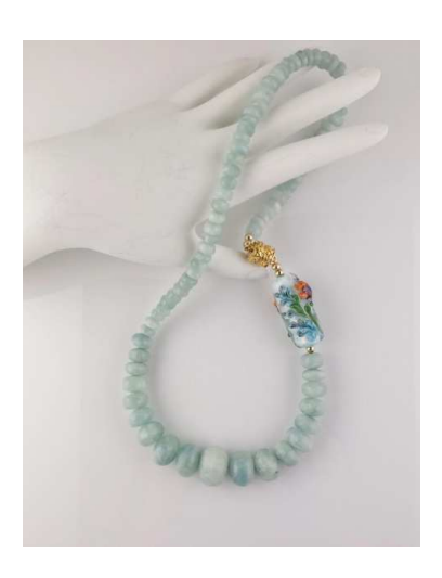
Aquamarine and Lamp work Necklace Private collection