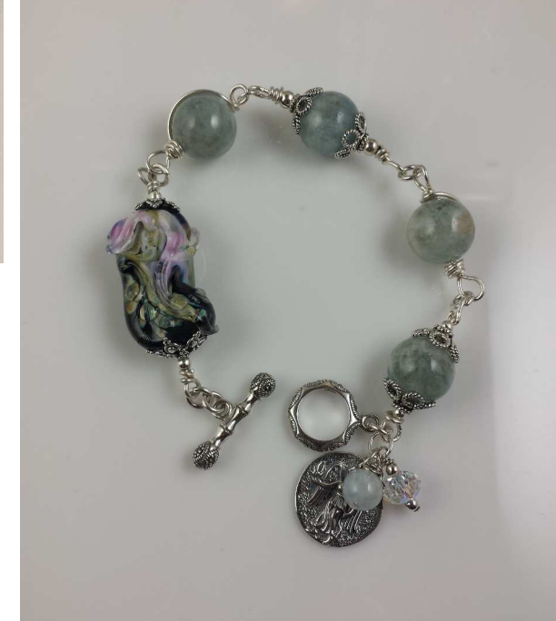
Aquamarine, Sterling and Lamp work Bracelet Private collection

"In order to be irreplaceable, one must always be different." Coco Chanel