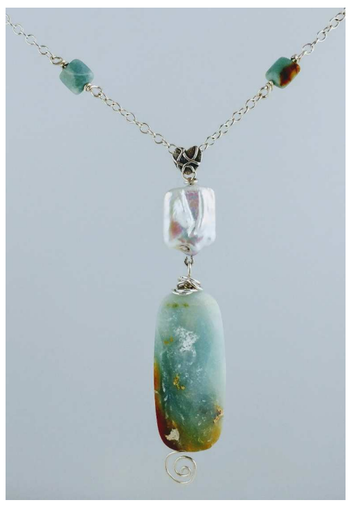
Amazonite Pendant Necklace with Freshwater Pearl Private collection Photo by Author

Amazonite Necklace with Accents of Fossilized Agate, Aquamarine, Aventurine, and Sterling Silver Photo by Author