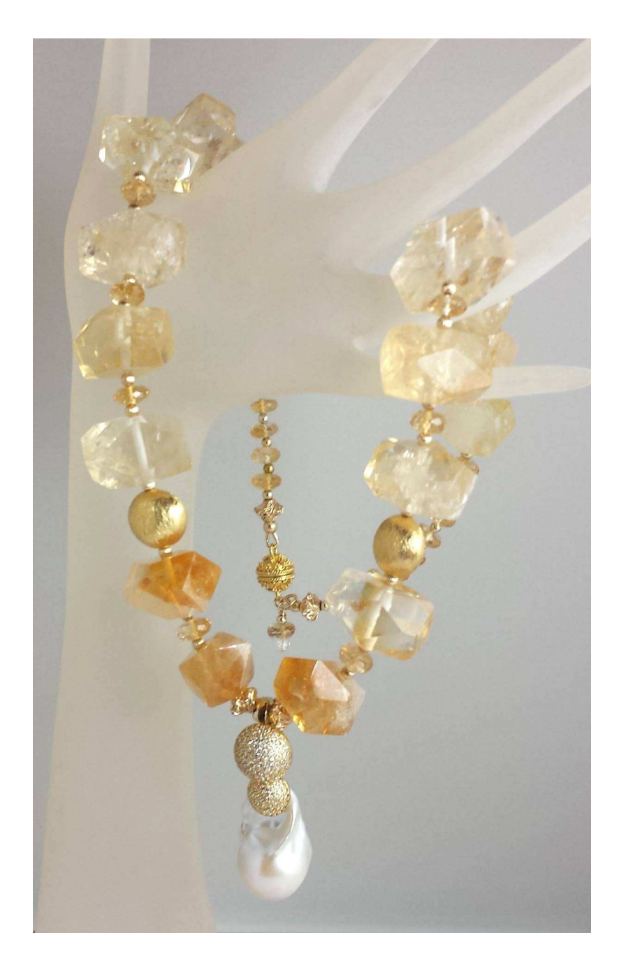
Citrine Nugget Necklace with Removable Baroque Pearl Enhancer Magnetic clasp by Nina Designs

Citrine is thought to attract wealth and became known as the merchant's stone since merchants would often keep one in their cash box.