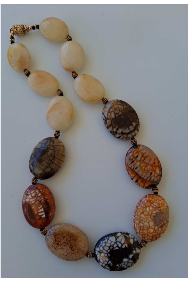
Mexican Fire Agate Necklace with Honey Jade and Black Zircon Accents Magnetic clasp by Nina Designs Photo by Author

Rare Cheetah Agate with Citrine and Black Onyx Accents Photo by Author