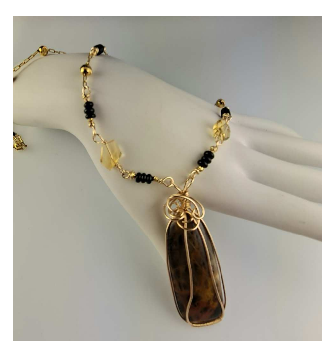
"Life is too short to wear boring jewelry." Latricia Buchanan

Agate is said to transform negative energy into positive energy and improve concentration and analytical abilities. It's a soothing, calming gemstone that heals inner anger and helps in strengthening relationships. Legend has it that Agate is one of the most powerful good luck stones. Owls are considered to be symbols of wisdom and knowledge..