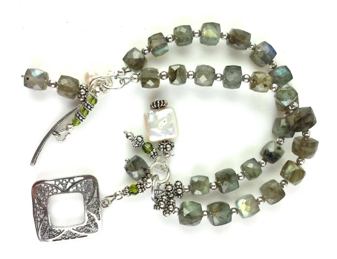
by Latricia Buchanan