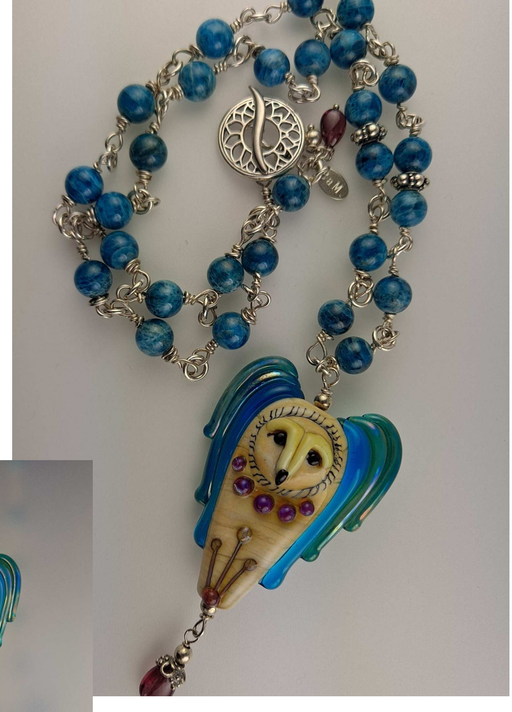
Apatite Beaded Necklace with Lamp work Focal Lamp work Owl bead by glass artist, Viktorija Vait

Owls are considered to be symbols of wisdom and knowledge.