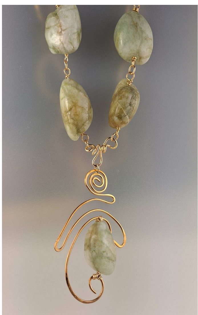
Aquamarine Nugget Necklace with 14kt Gold- Filled Accents