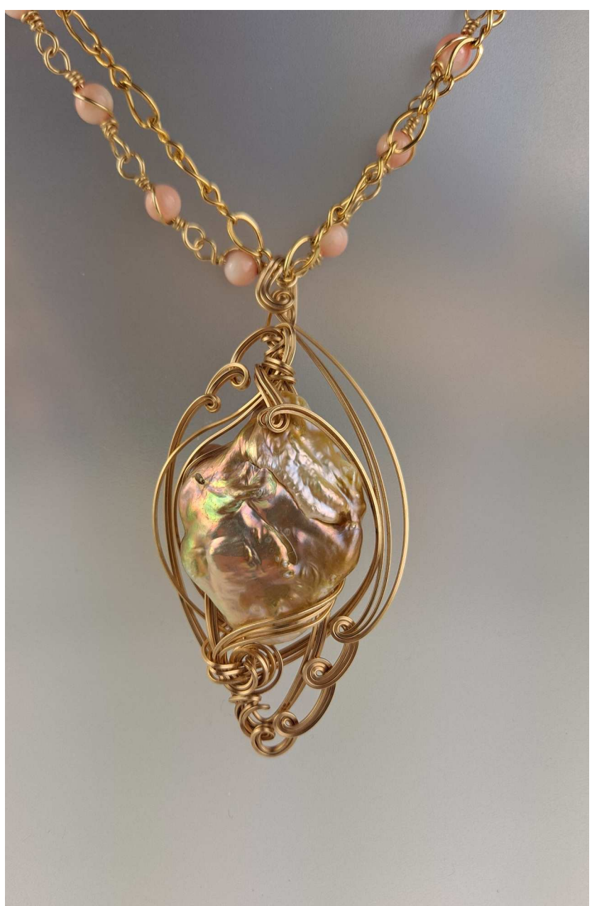
Coral Necklace with Removable Baroque Pearl Enhancer