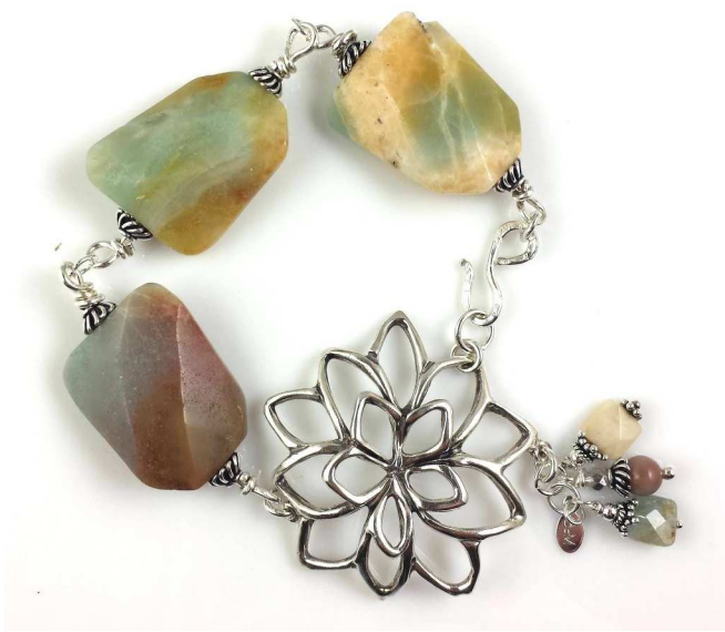
Amazonite Bracelet with Sterling Silver Accents